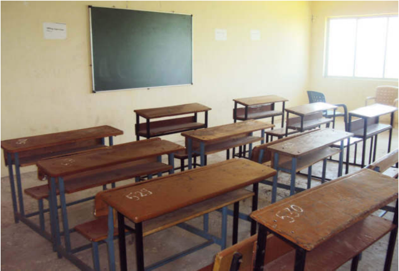
Method Room - 1