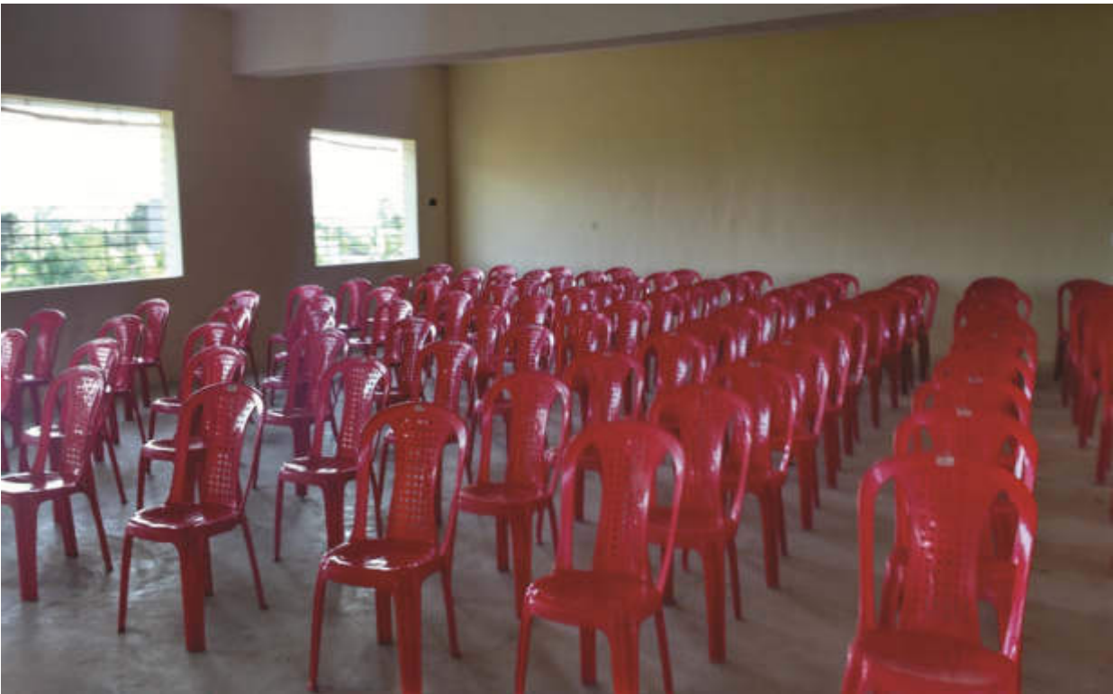
Multi Purpose Hall