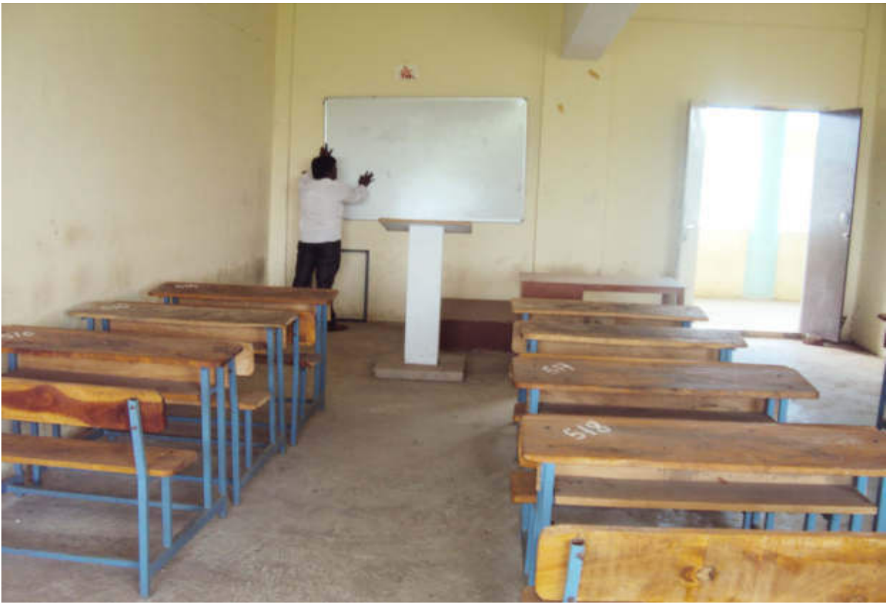
Method Room - 3