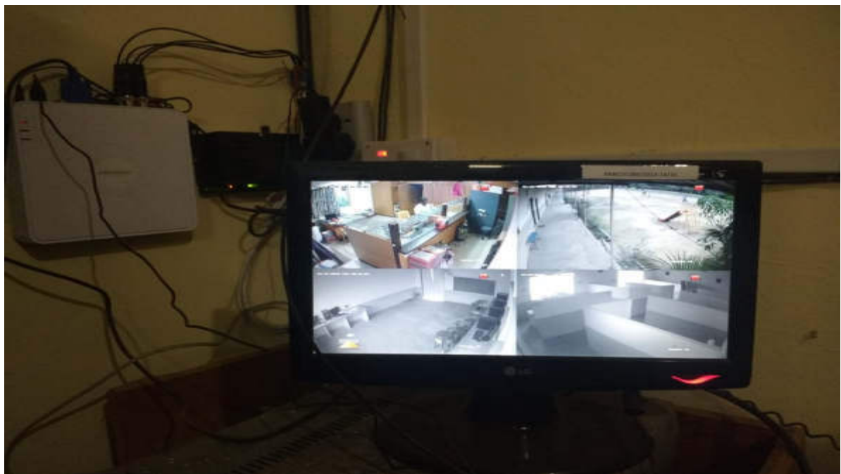
CC TV CAMERA