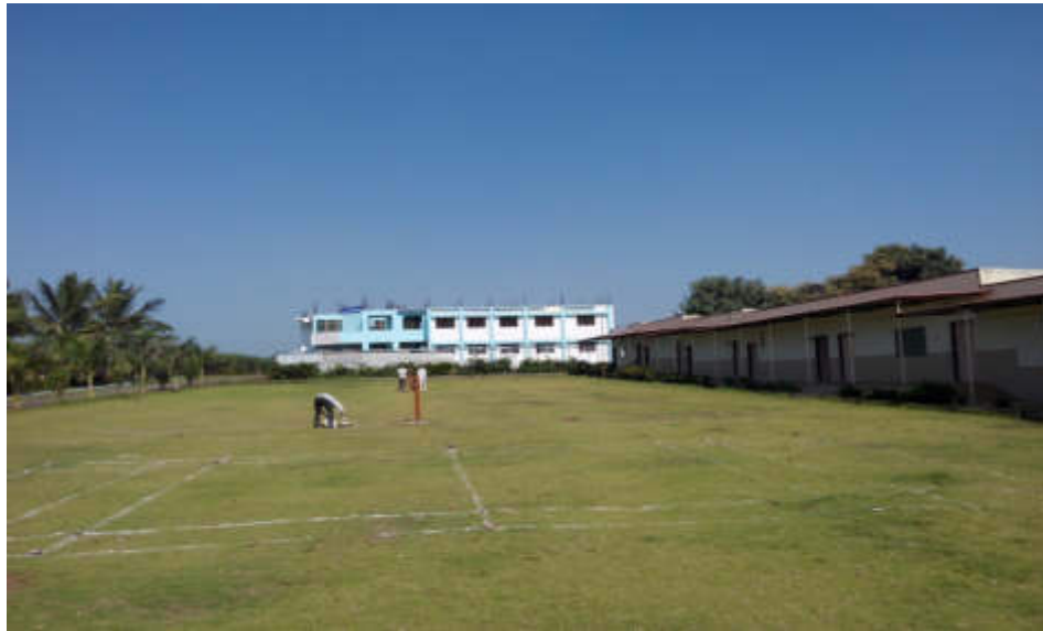
College Premises & Building