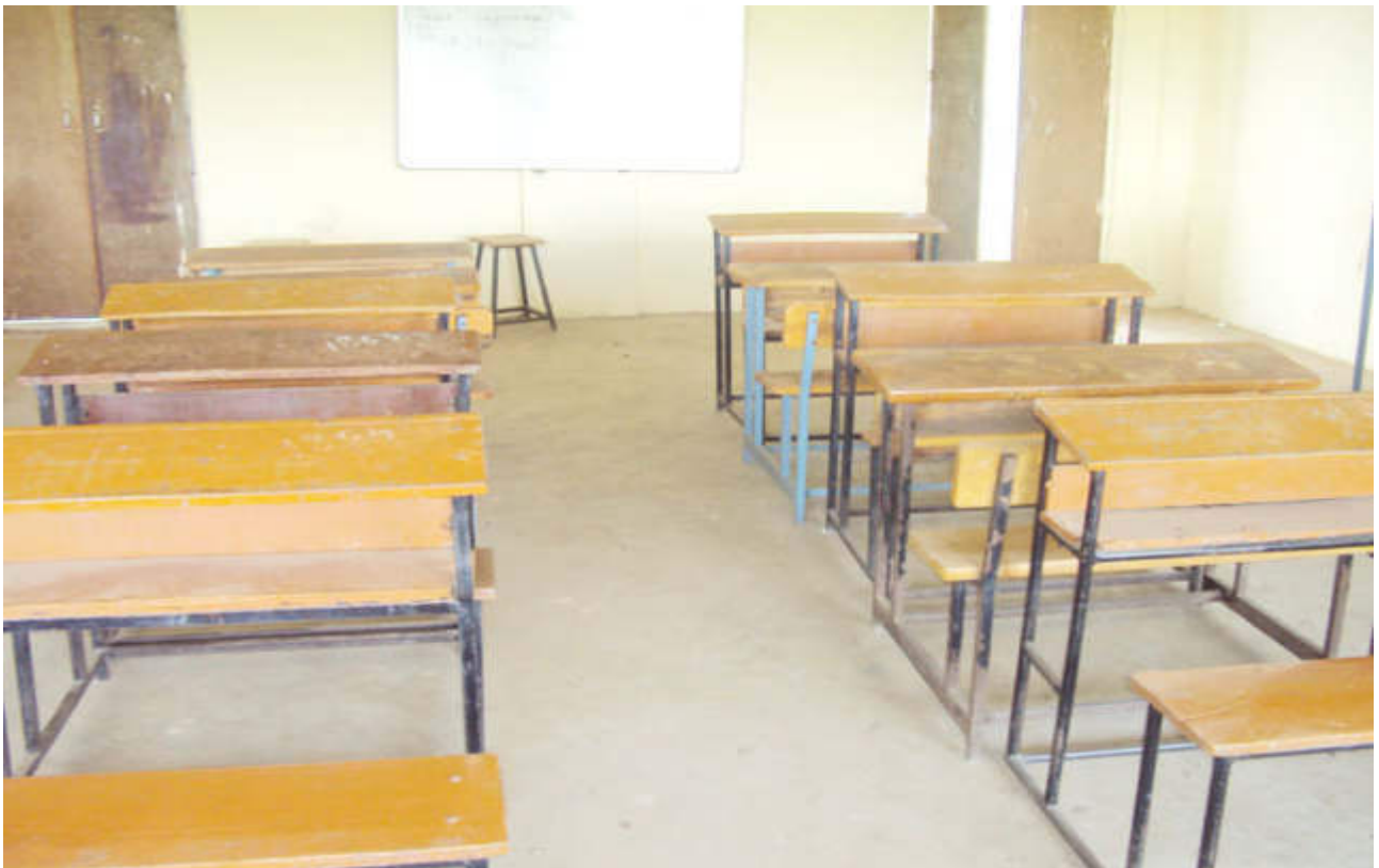
Method Room - 4