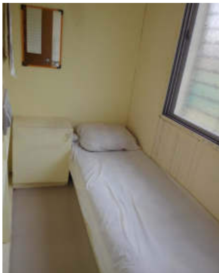
Principal Rest Room