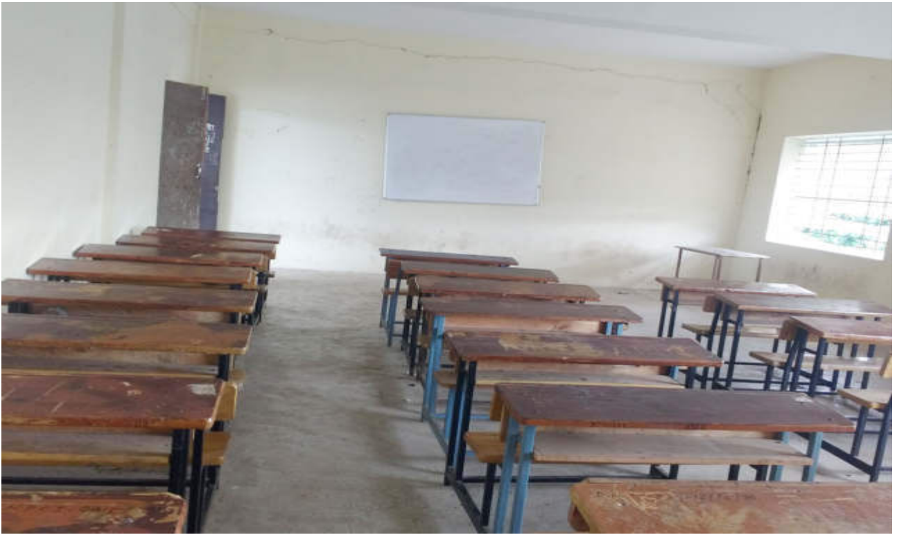
Theory Lecture Hall - 1