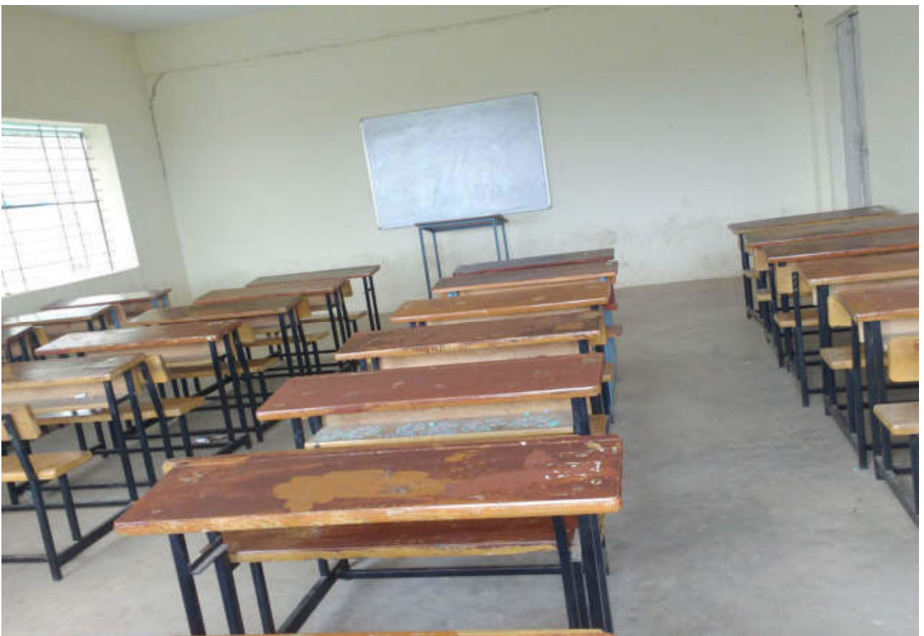
Theory Lecture Hall - 2