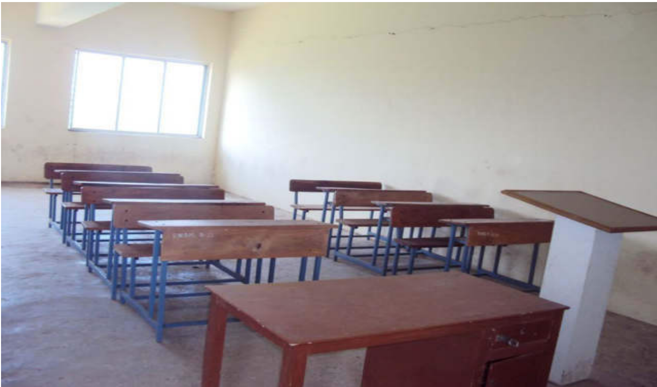
Method Room - 2